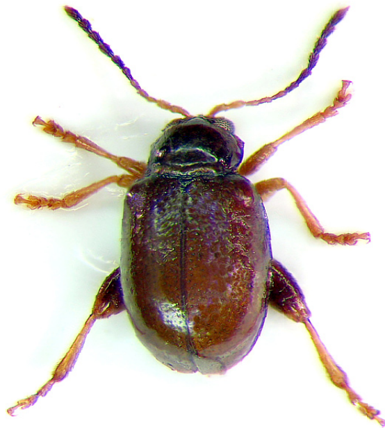
Fig. 1. Dorsal habitus of Orisaltata medvedevi sp. n. Рис. 1. Orisaltata medvedevi sp. n. , габитус сверху.

A second species of Orisaltata Prathapan et Konstantinov, 2006 (Coleoptera: Chrysomelidae: Galerucinae: Alticini)